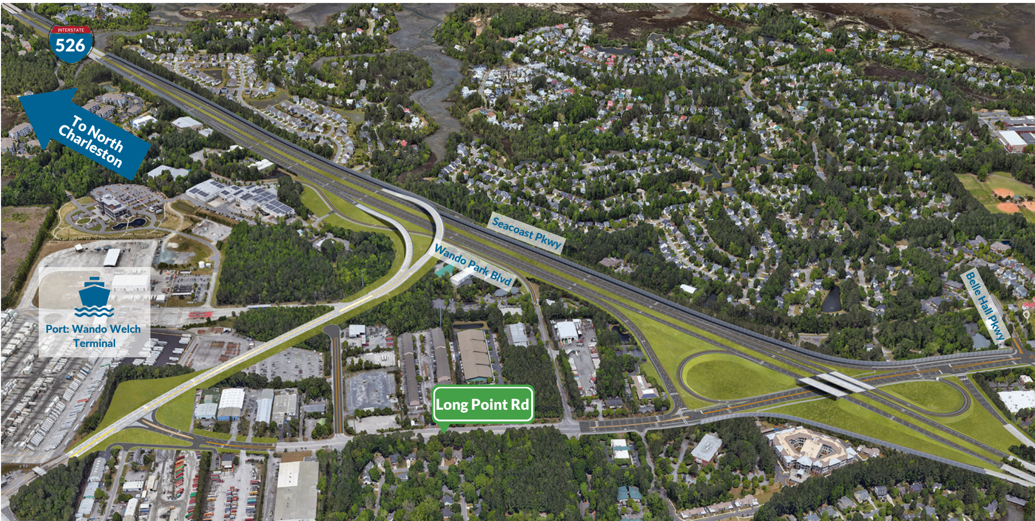
The content of this display is conceptual only and not to be used for any type of construction, maintenance, or acquisition of right-of-way. As of April 2023.